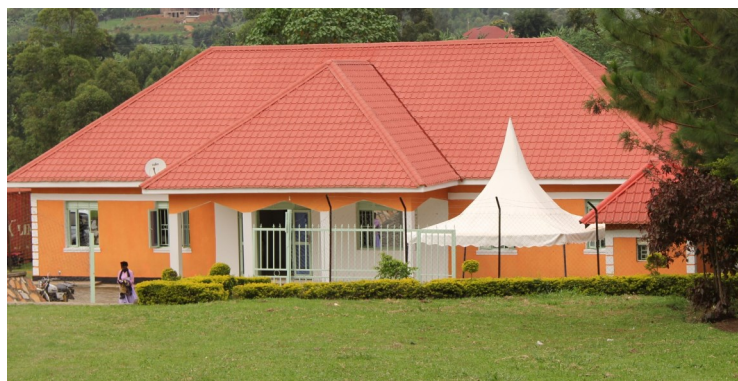
John H. and Marie Parrish Medical Clinic, Fort Portal, Uganda. Opened May 17, 2016.

Besides Ebola, another virus threatened the area—the Coronavirus. In the Democratic Republic of Congo (DRC), there were many cases. Staff are asking for prayers for the region because many of the Clinic's clients come from the DRC on business to Uganda. Clinic staff is trained to